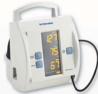
ri-medice table top