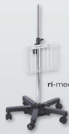
ri-medice mobile stand