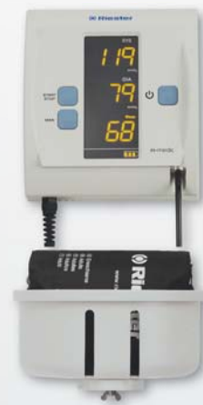
ri-medice wall mount